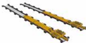
LH, HSK-Series Skidding Systems