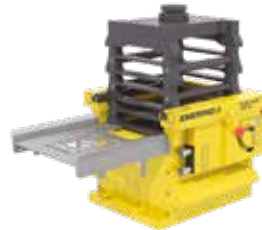
SCJ-Series, Self-Locking Cube Jacks