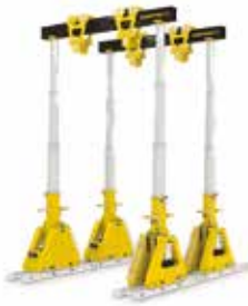
SL, SBL-Series, Telescopic Hydraulic Gantries