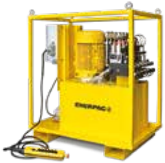
SFP-Series, Split-Flow Pumps