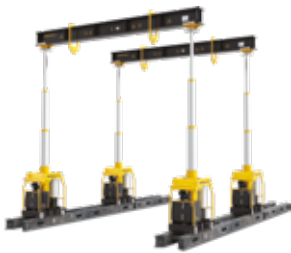
ML-Series Mini-Lift Gantry