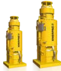
HSL-Series, Strand Jack Systems