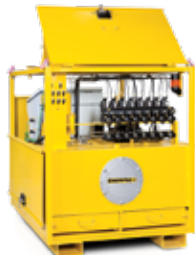
EVO-Series, Synchronous Lifting Systems