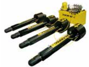
SHS, SHAS-Series, SyncHoist Synchronous Hoisting Systems