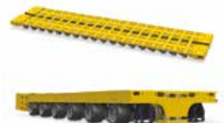
SPMT-Series, Self-Propelled Modular Trailers