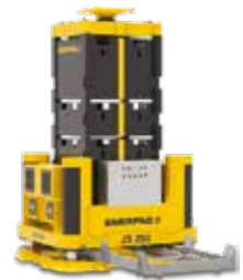
JS-Series Jack-Up Systems