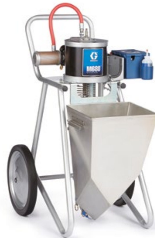
ToughTek M680a CS

The ToughTek M680a piston pump handles abrasive materials such as epoxy mortars, non-skid coatings (bridges and marine industry – solvent based coatings) or cementitious materials, and tackles difficult polymers with fillers such as glass flake, silica or sand. The all stainless design makes cleanup of epoxy mortars easy and worry-free.