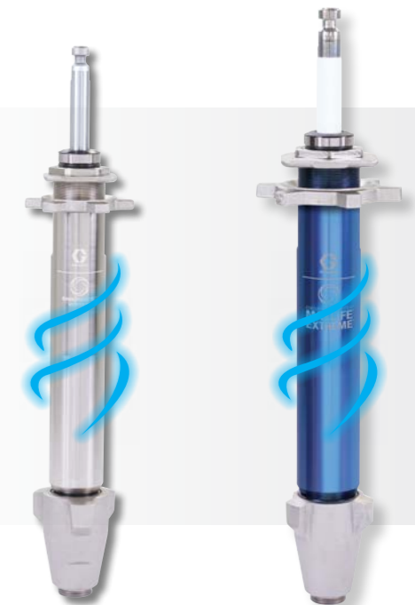
Endurance Vortex Chromex™ Pump Lasts 3X longer than competing pumps