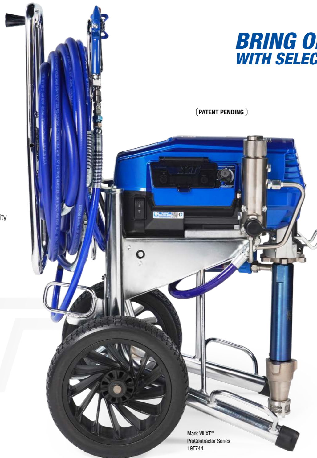
Mark VII XT™ ProContractor Series 19F744