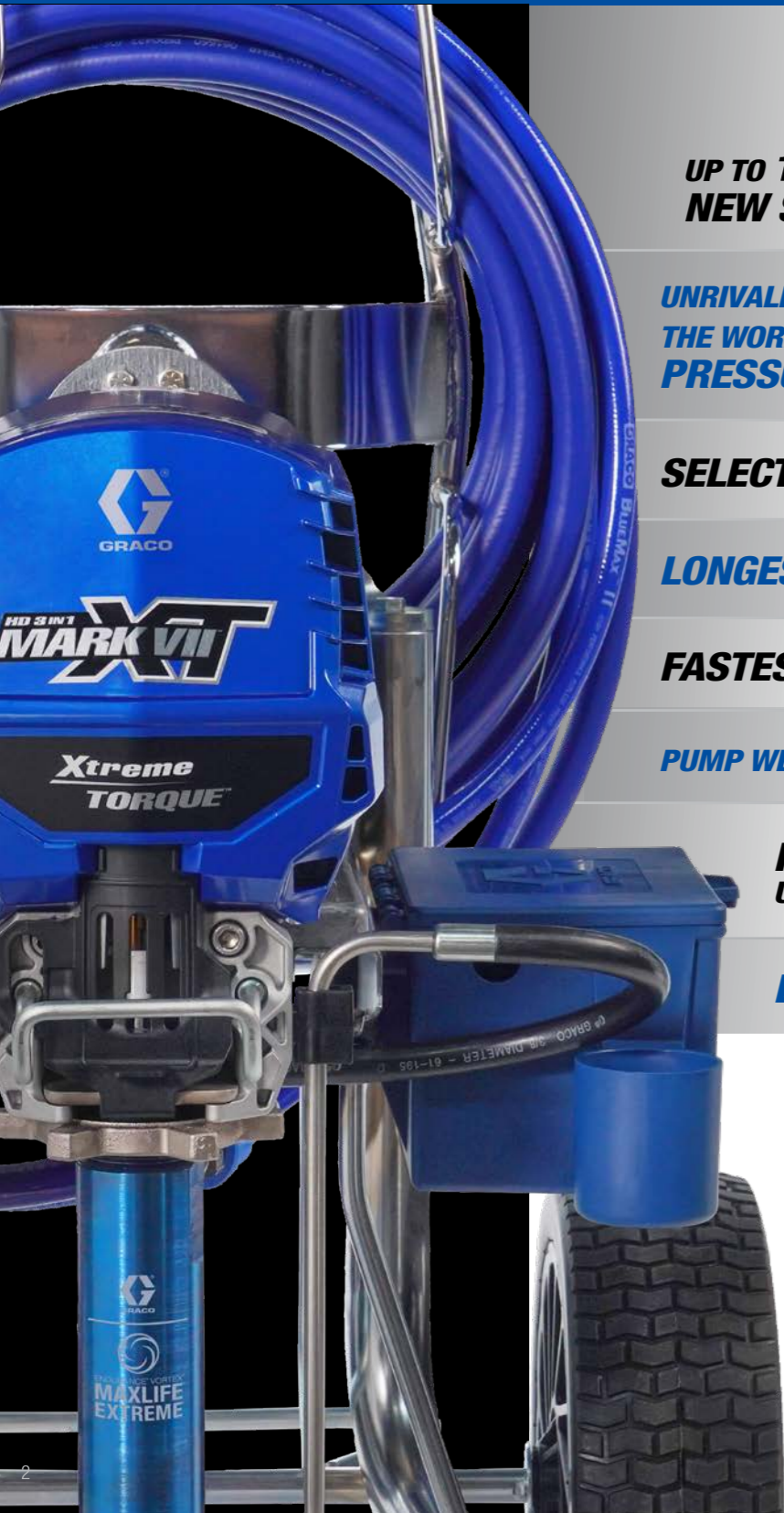
Mark VII XT™ ProContractor Series 19F744

Oversized fluid passages and hoses allow for more fluid flow area and less pressure loss when spraying thick coatings.