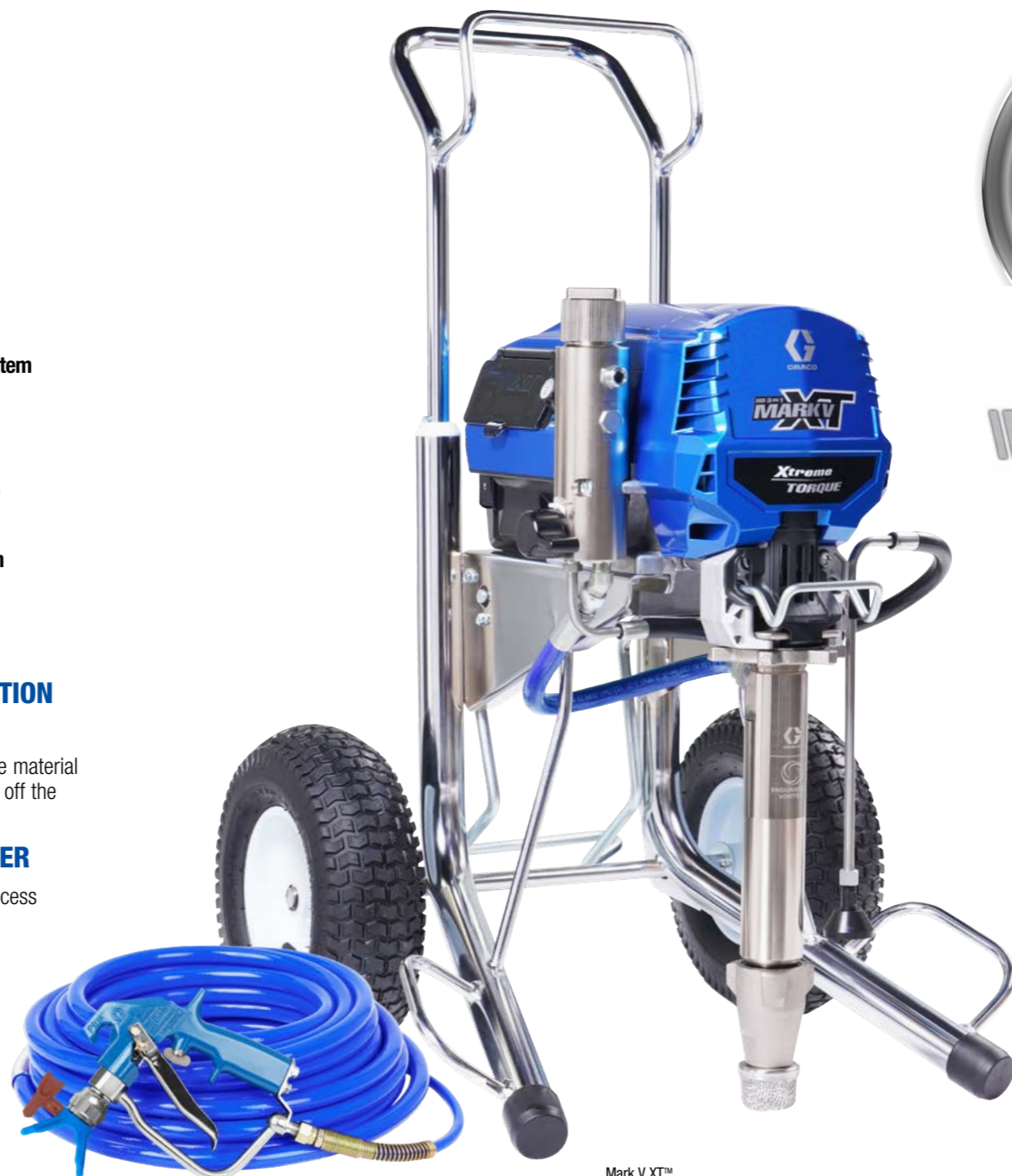
Mark V XT™ Standard Series 19F739