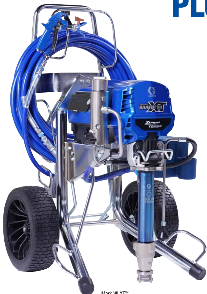
Mark VII XT™ ProContractor Series 19F744